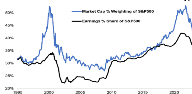
Exhibit 4: S&P 500 Techy Sectors (Technology + Communication Services + Consumer Discretionary)